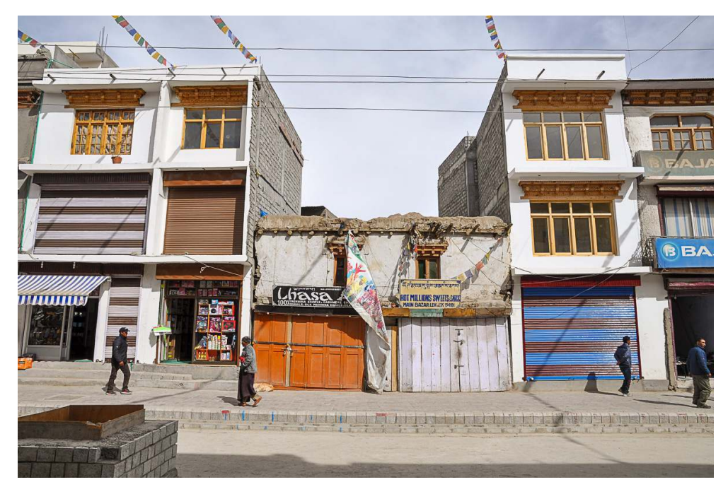
OLD ARCHITECTURAL STRUCTURE BETWEEN TWO RECENTLY CONSTRUCTED BUILDINGS IN THE MAIN BAZAAR JUDITH MÜLLER, MAY 2016