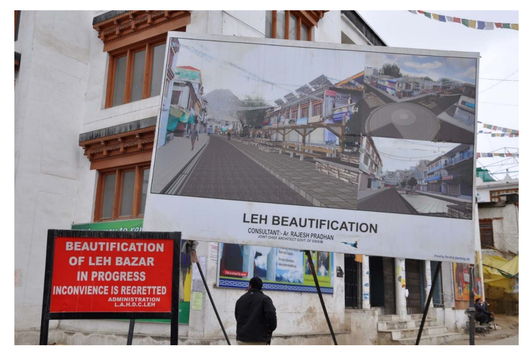
MODEL PLAN FOR THE MAIN BAZAAR AFTER THE EXAMPLE OF GANGTOK, SIKKIM JUDITH MÜLLER, MARCH 2015

The sketched outlay planned to turn the main commercial street into a pedestrian zone. By the beginning of 2016, traffic had been banned, old trees at the main bazaar felled and several old buildings demolished for the construction of new ones.