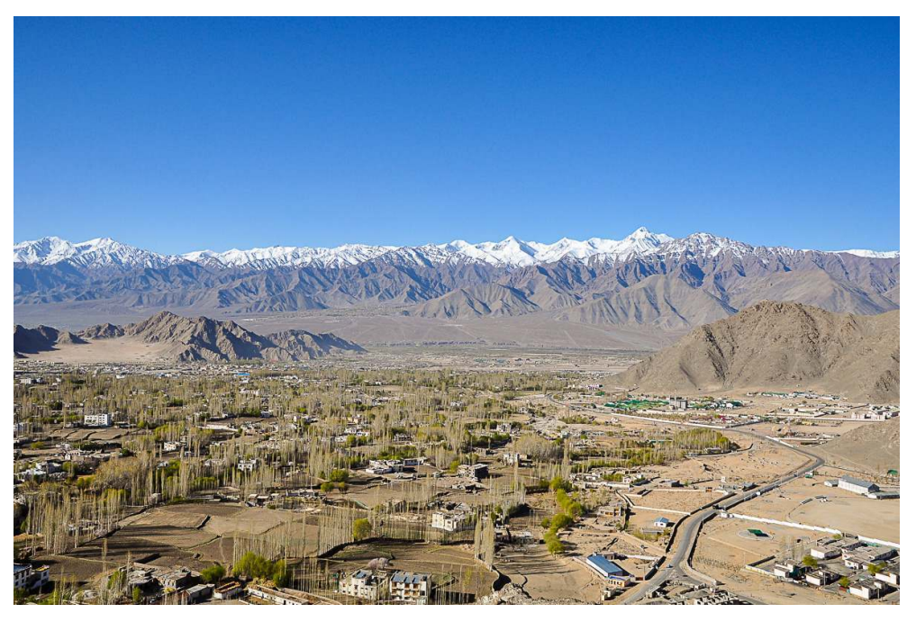
SETTLEMENT AND AGRICULTURAL AREA OF LEH, SITUATED IN THE HIGH ALTITUDE DESERT OF LADAKH, WITH INDUS VALLEY AND STOK RANGE IN THE BACKGROUND JUDITH MÜLLER, APRIL 2016

Due to the rain shadow effect of the Himalayan Range (Nüsser, Schmidt and Dame 2012:52), the town experiences arid conditions with prevailing seasonality of water availability.