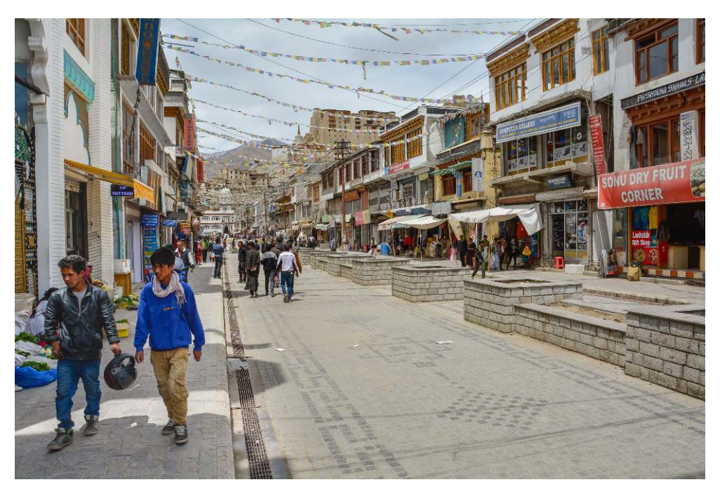
NEW DESIGN OF THE MAIN BAZAAR WITH POTENTIAL FLOWER POTS IN THE MIDDLE OF THE STREET JUDITH MÜLLER, MAY 2016

The new design of the main bazaar was sketched by a town planner from Sikkim. In 2011, the Chief Executive Councillor of the Hill Council invited him to draft a plan following the example of the renewal of MG Street in Gangtok (Reach Ladakh 2011a; Epilogue 2011:40–41). Gangtok, which had been selected under the UIDSSMT in 2005, represents a preferential model for urban development due to its perceived cultural "closeness" to Leh as a small, Buddhist-dominated mountain town.<sup>8</sup>