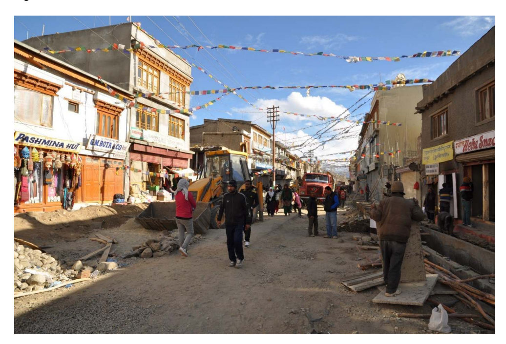
THE TRANSFORMATION OF THE MAIN BAZAAR IN LEH JUDITH MÜLLER, APRIL 2015