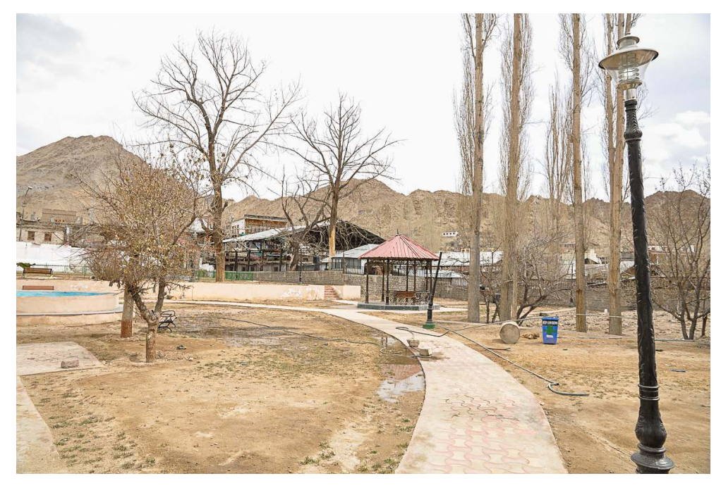
THE NEWLY CONSTRUCTED RECREATIONAL "ECO-MUNICIPAL PARK" ADJACENT TO THE MAIN BAZAAR JUDITH MÜLLER, MARCH 2016

Construction of such a socio-nature is a typical example of the ecological imaginaries of urban spaces by the elites. It illustrates the tension of efforts to improve the living conditions of the inhabitants of Leh on the one hand, and the felt need to adapt urban design to the perceived imaginaries of tourists who increasingly stem from emerging Indian middle classes, on the other. Yet contrary to other cases in India where parks have been created on sites of former slum settlements (e.g. Zimmer, Cornea and Véron 2016), the urban park has been designed on a terrain which had been a recreational space in colonial times and was afterwards used for administrative buildings<sup>12</sup> and therefore engendered no direct conflicts.