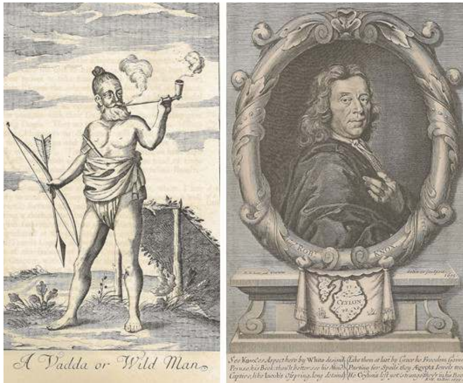
AN HISTORICAL RELATION OF THE ISLAND CEYLON IN THE EAST INDIES (1681)