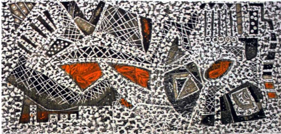
Figure 3: Safiuddin Ahmed, Sound of Water , aquatint, soft ground, mezzotint and deep etch, 1985.

Courtesy of Art and Artists of Bangladesh , multimedia cd published by Rakhal Balak, Dhaka, 2008.