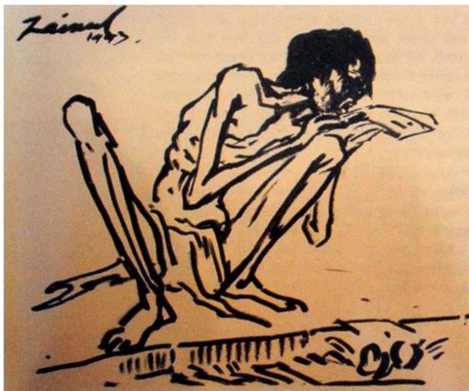
Figure 1: Zainul Abedin, Famine Sketch-13 , brush and ink on paper, 1943.