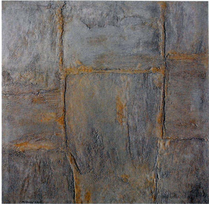
Figure 4: Mohammad Kibria, Untitled-32 , oil on canvas, 2001.

Courtesy of Art and Artists of Bangladesh , multimedia cd published by Rakhal Balak, Dhaka, 2008.