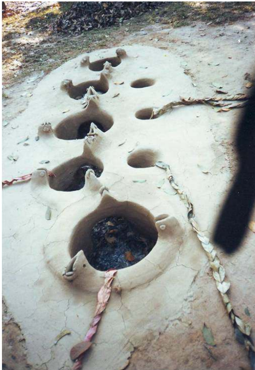
Figure 9: Dhali Al Mamoon, Biography of Leaves , installation, 2003.