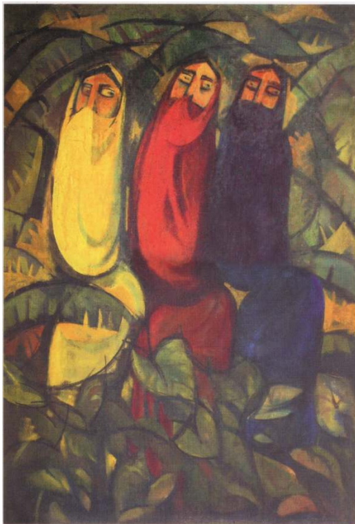
Figure 2: Quamrul Hassan, Three Women - 1 , oil on masonite board, 1955.

Courtesy of Art and Artists of Bangladesh , multimedia cd published by Rakhal Balak, Dhaka, 2008.