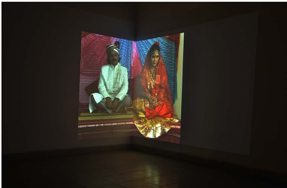
Figure 7: Tyeba Begum Lipi, I Wed Myself , video art, double channel projection, 2010.