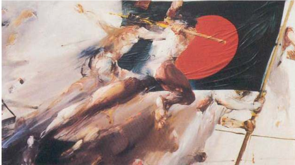
Figure 6: Shahabuddin Ahmed, Bangladesh , oil on canvas, 1997.