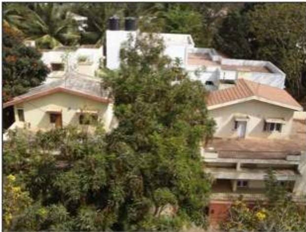
Figure 1. A view from above on Dollar Colony (2006)