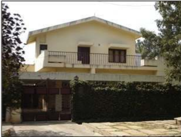
Figure 2. A house with initial design, unchanged, in Dollar Colony (2006)